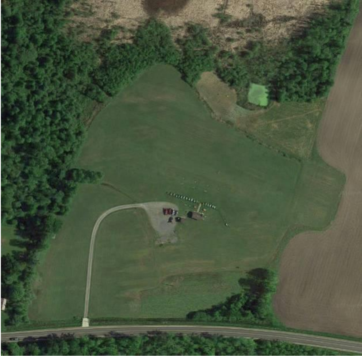
STARS Field Satellite photo